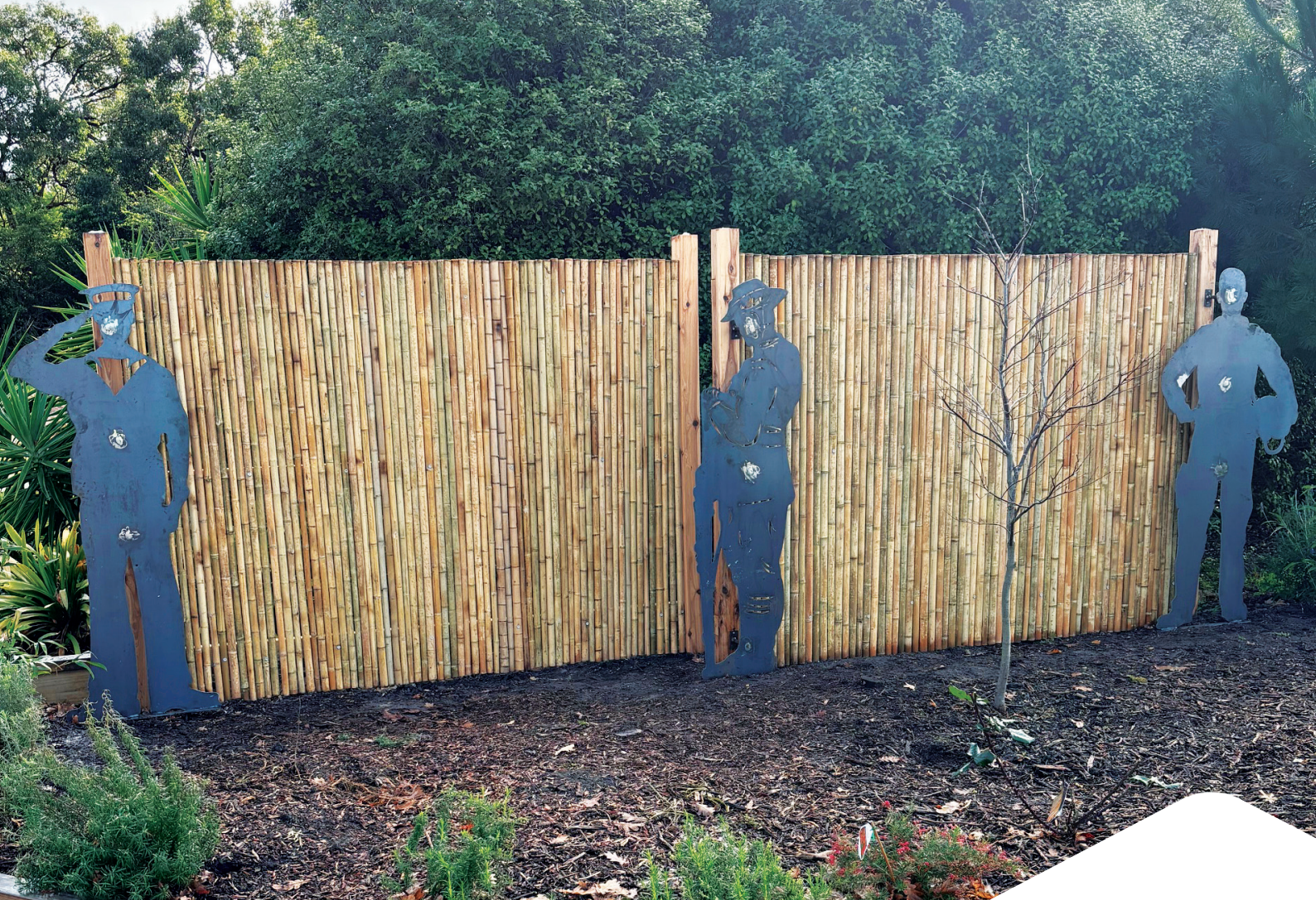
Commemorative mural at Inverloch RSL Sub-Branch.