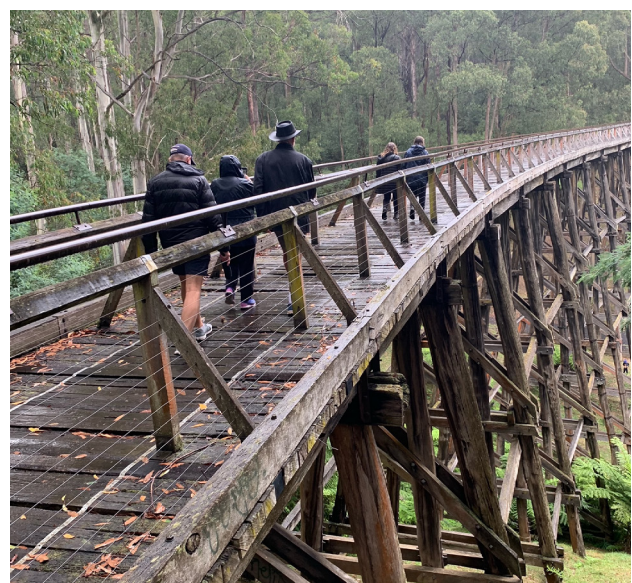
Veterans hiking on the Warragul RSL Sub-Branch Veterans Retreat in April 2024.