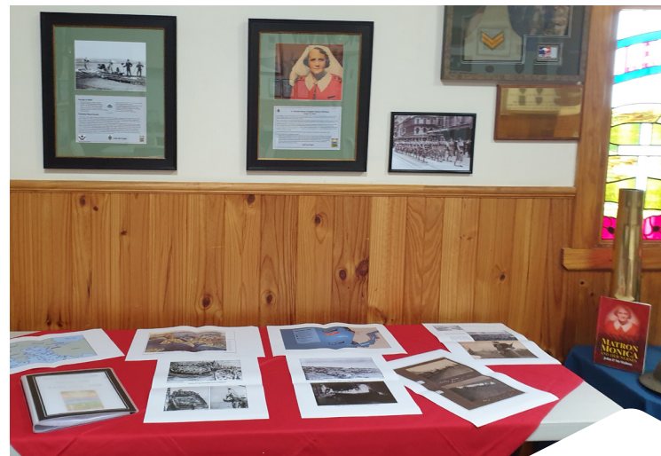
Recognition of women in active service at Bright RSL Sub-Branch.