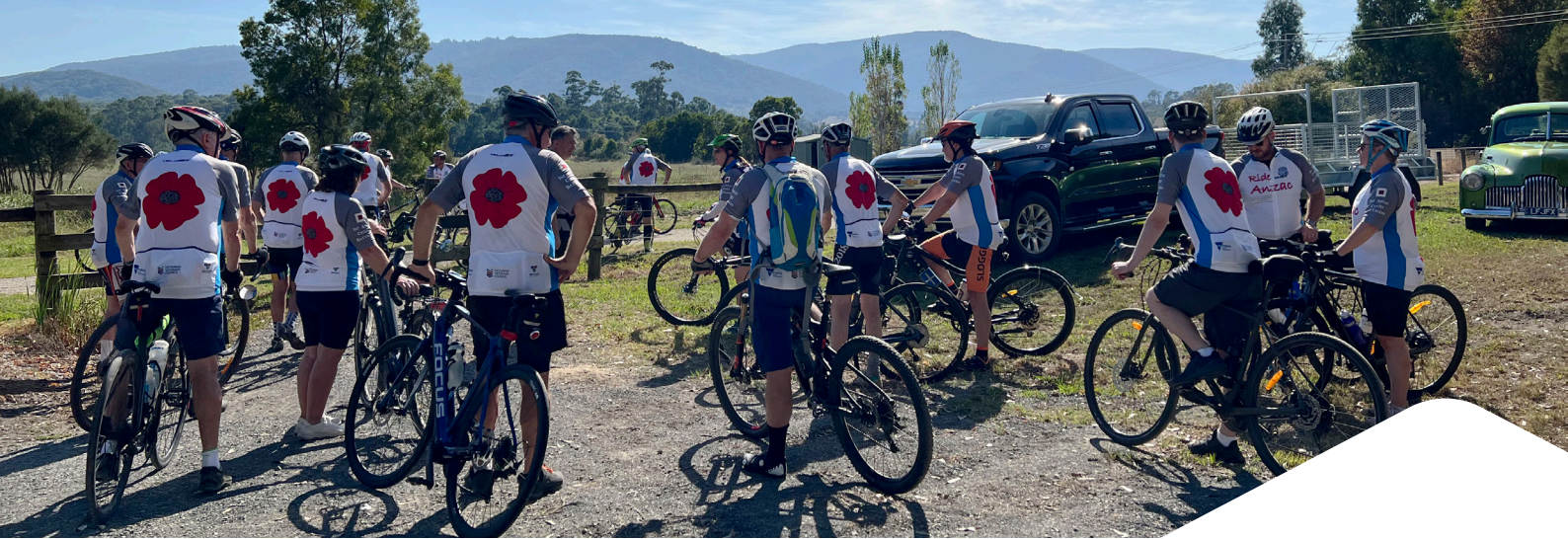
Riders prepare to depart for Ride Anzac in March 2024.