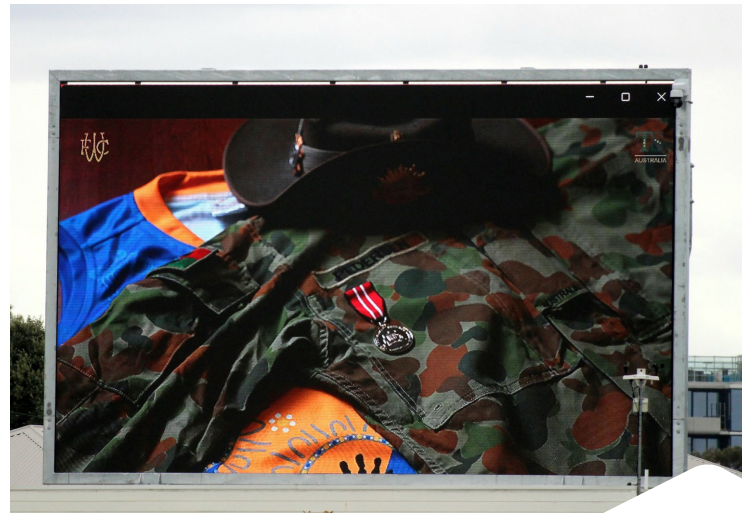
Documentary interviews screened at the Williamstown Football Club.